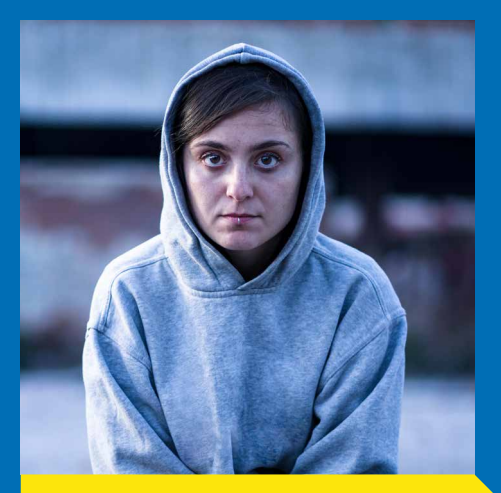
HEAR FIRST-HAND STORIES

Aussies who've lived through the harsh reality of homelessness will share their stories. Find out just how easy it is to slip through the cracks... and discover how it can all turn around thanks to your life-changing support.