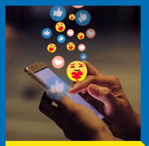
CONNECT & SHARE ONLINE

Aussies who've lived through the harsh reality of homelessness will share their stories. Find out just how easy it is to slip through the cracks... and discover how it can all turn around thanks to your life-changing support.