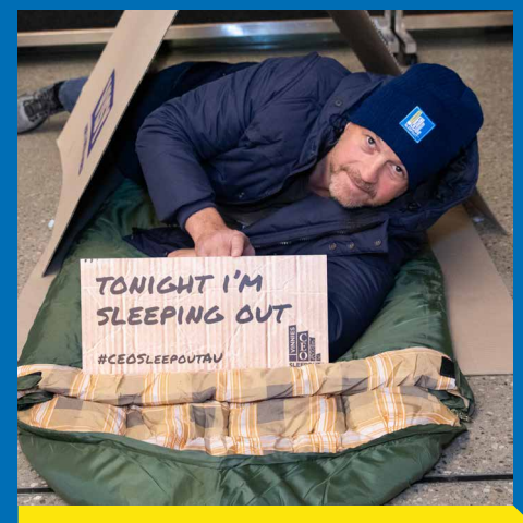
STAY IN TO SLEEPOUT

There'll be more details about how to join coming soon.